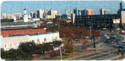
City of Myrtle Beach, SC