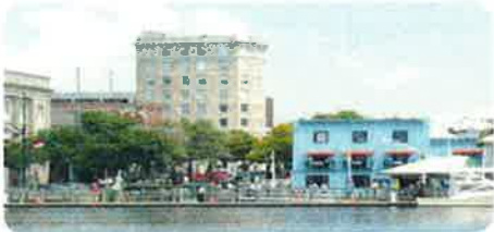
City of Wilmington, NC