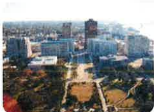
City of Durham, NC