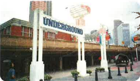
City of Atlanta, GA