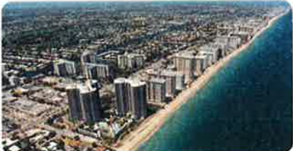
City of Wilton Manors, FL