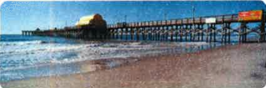
Horry County, SC