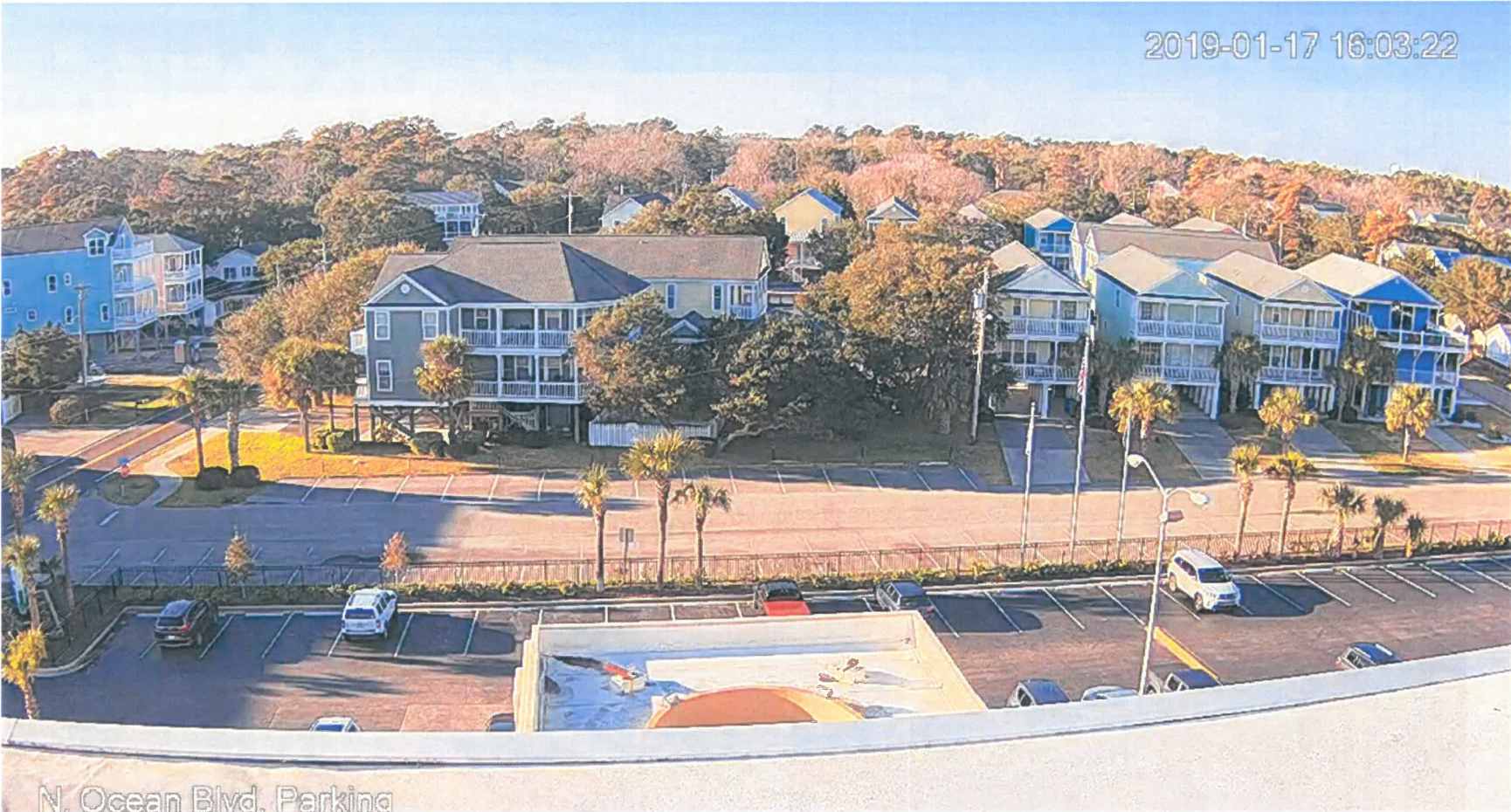
N. Ocean Blvd. Parking