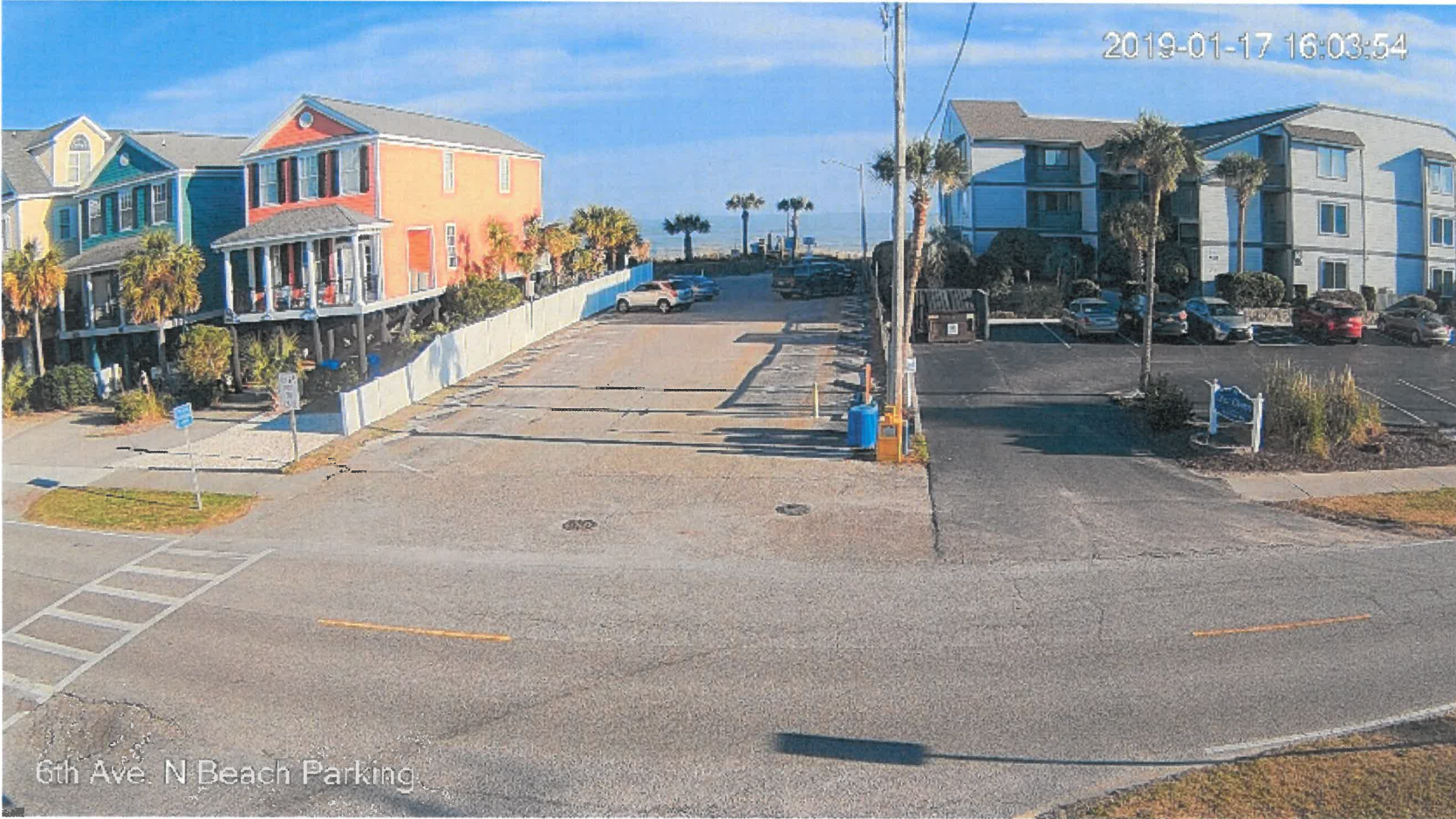
6th Ave. N Beach Parking