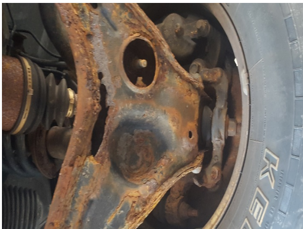
Lower Control Arm Condition

Staff recommends the approval of this purchase, for efficient fleet management.